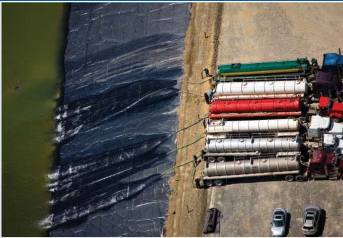
Tanker trucks filling water reservoir at hydro-fracking gas drilling operations near Sopertown, Columbia Township, PA