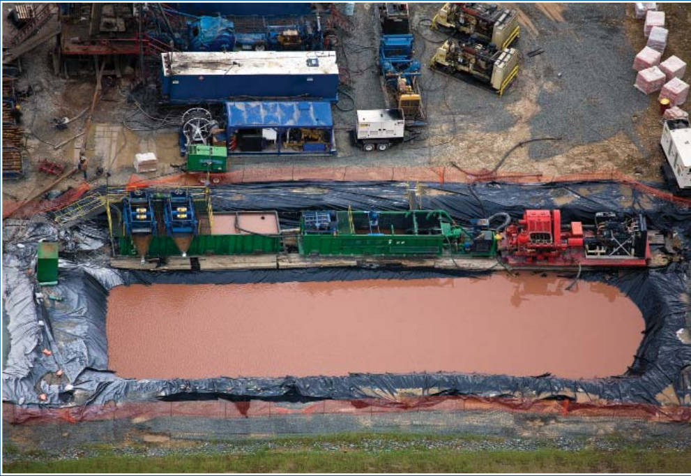
Waste pond at hydro-fracking drill site, Dimock, PA