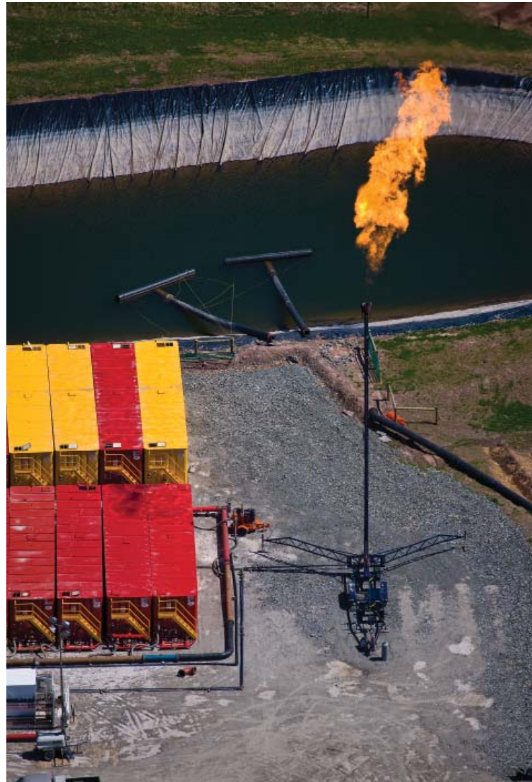
Flare at hydro-fracking gas drilling operations near Sopertown, Columbia Township, PA

A lender's title policy insures the mortgage lien, as of the date of the policy (up to the loan amount), against loss or damage if title is vested in someone other than the homeowner. Gas leases signed after the policy date are not covered by the policy. Gas leases in effect when the policy is issued will be listed as a title exception. Coverage won't include the gas lease or any claims arising out of it. Title endorsements don't eliminate this exception to coverage. Underwriters consider these exceptions a red flag, sufficient to jeopardize the loan. Lenders financing properties subject to compulsory integration won't discover the title encumbrance from a title search because ECL § 23-0901 makes no apparent reference to recording the DEC determination of compulsory integration in the land records. New York title policies expressly exclude from coverage loss or claims relating to any permit regulating land use. It remains unclear